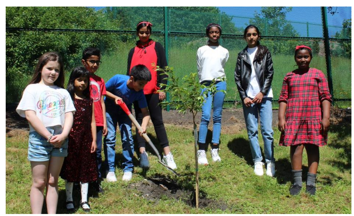
Members of our school Eco Warriors Team plant a cherry tree in the school grounds to commemorate the Queen's Platinum Jubilee.